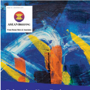
Relocating Your Business from China to ASEAN

Relocating a portion of your production to Vietnam? Read about how to plan a supply chain shift.