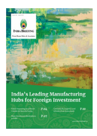
Relocating a portion of your production to India? Read up on Special Economic Zones in India.

Relocating a portion of your production to Vietnam? Read about how to plan a supply chain shift.